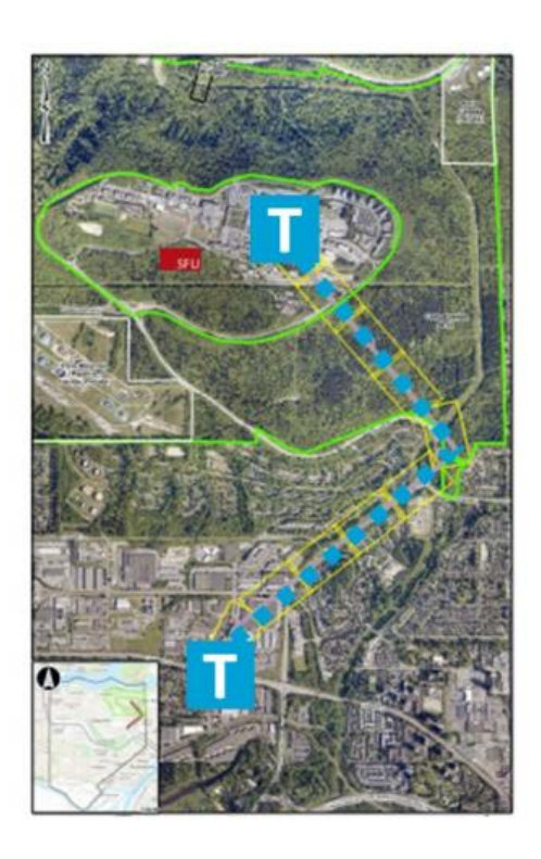
Figure 2: Gondola route from Production Way-University SkyTrain station to SFU with midway station