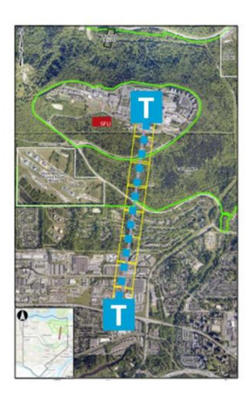
Figure 1: Preferred gondola route from Production Way-University SkyTrain station to SFU