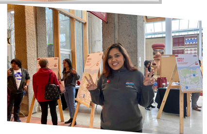
UAA Committee members hosting the first Gondola Open House