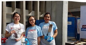
SFSS Board Members at Welcome Day 2019 and the Annual Pancake Breakfast