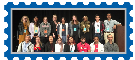
Osob and I with the students of the 16th Annual Open Education Conference