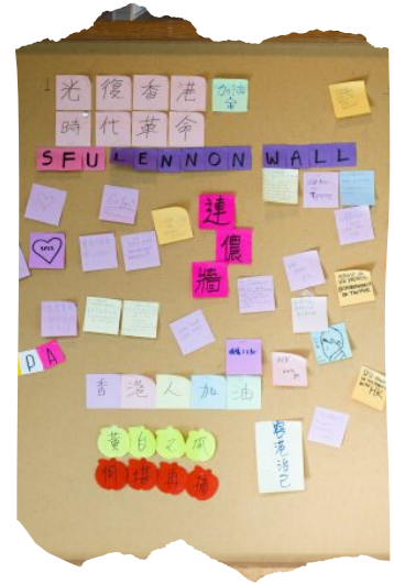
SFSS Lennon Wall 2019