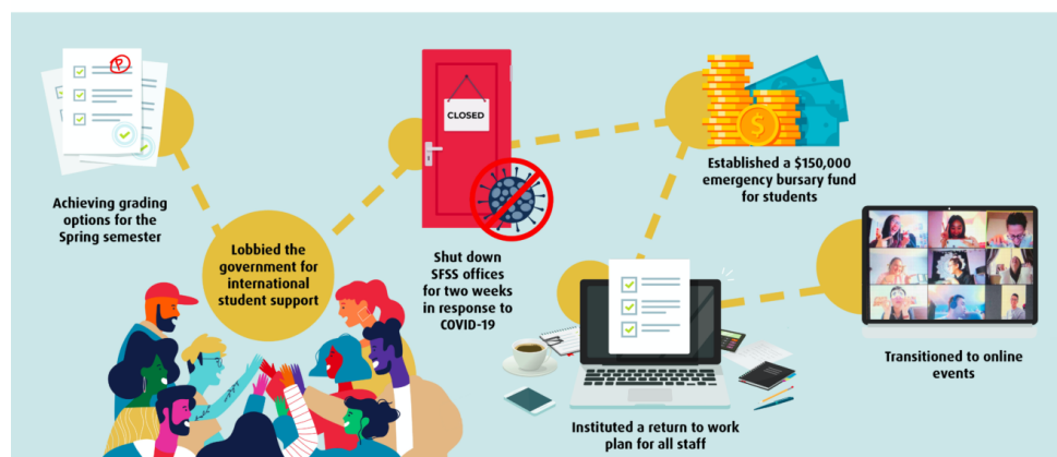
The SFSS response to COVID-19