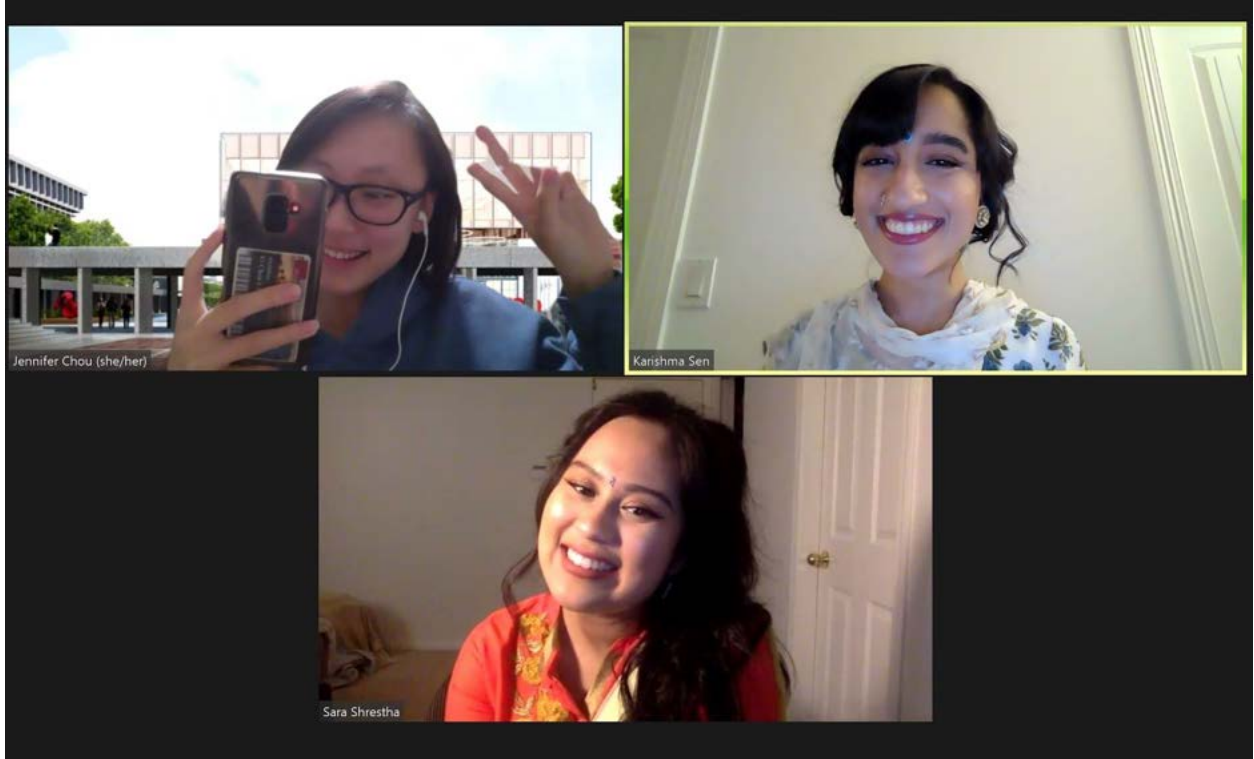
Screenshot of the SFU Befikre Dance Workshop